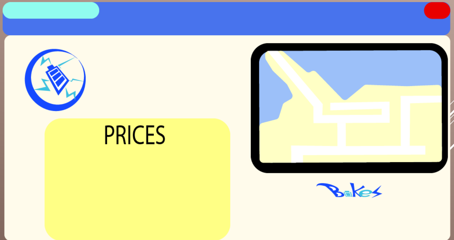
Example of the website

In the website the customer can find out the pricing details .